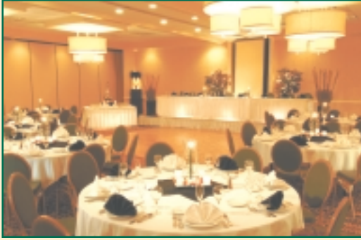
Strongsville Chamber of Commerce member the Holiday Inn Select has a huge conference and meeting area which can accommodate meetings of 10 to 1,000 people.

Strongsville Chamber of Commerce member Holiday Inn Select Hotel recently completed a $5 million renovation of the entire facility.